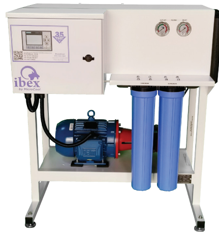
The IBEX pump is designed for performance, safety and ease of use.

IBEX pumps deliver from 1 to 11 US gpm (2 to 42 lpm) and can be configured for single and multiple zones using the zone controller. A convenient LCD screen provides access to a full range of safety, performance and service settings. Standard 5 and 10 micron filters can easily be replaced, and an Ultraviolet light can be mounted at the rear.